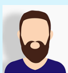
President or Chairperson